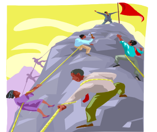
Real success comes by fulfilling God's purposes for your life.

interdependent with other believers—they allow God's strength in their lives to support others, and they receive God's strength from others to enable them to glorify God in the world. This mutual support begins with a public identification with Christ through water baptism, and then with a commitment to a local body, which is called church membership. Having done this we all know upon whom we can depend. We then cultivate these relationships by showing love to one another and spending time with